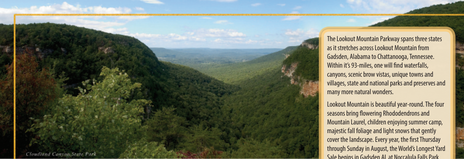
Cloudland Canyon State Park